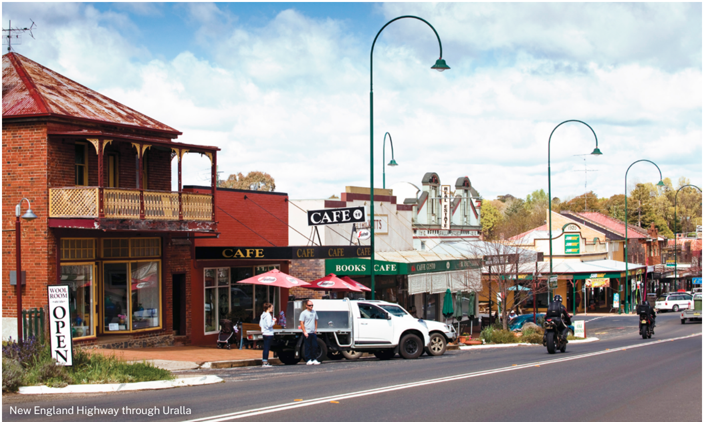
New England Highway through Uralla