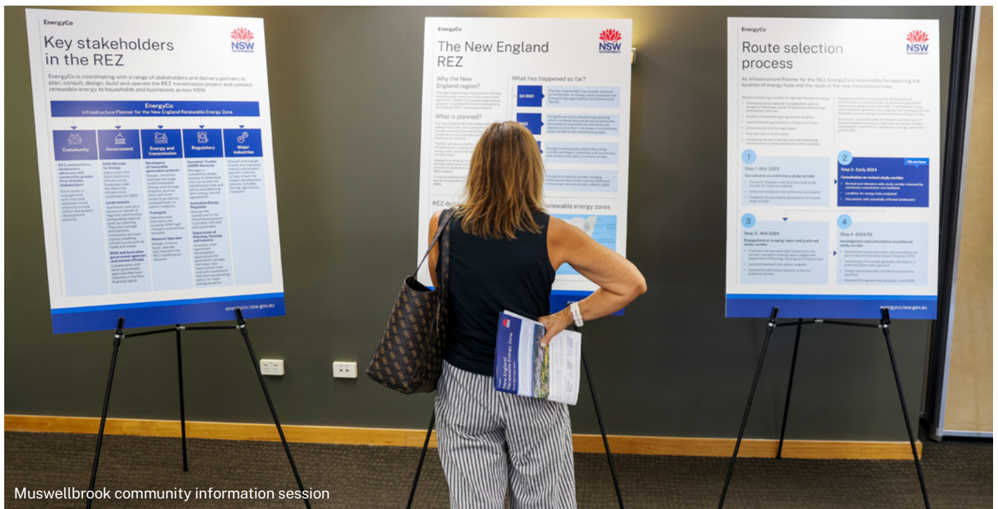
Muswellbrook community information session