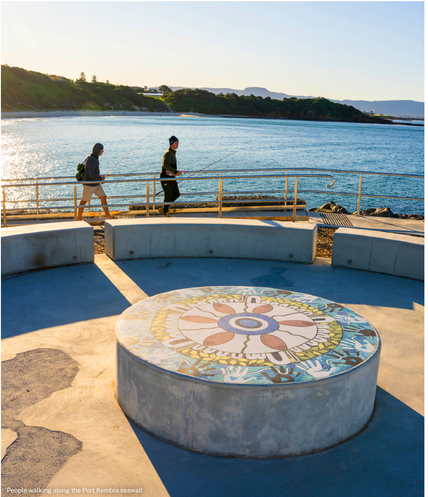
People walking along the Port Kembla seawall