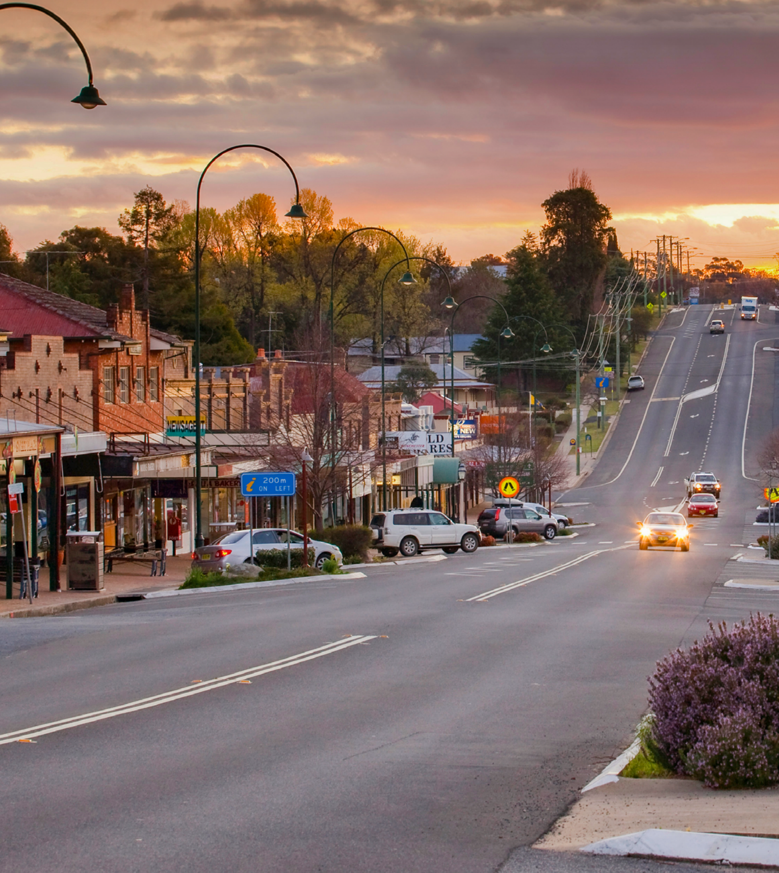
New England Highway at dusk through Uralla