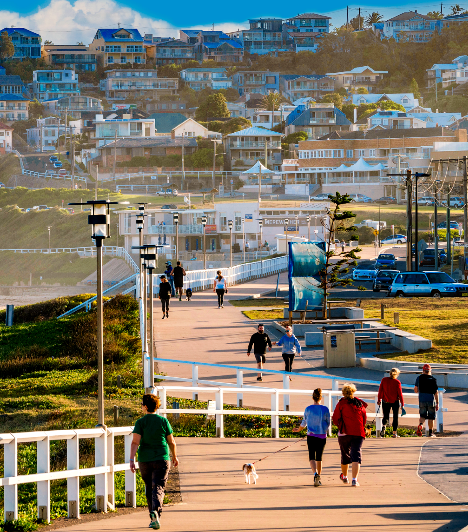
People walk along the Yuelarbah Walking Track at Merewether Beach. Newcastle, NSW