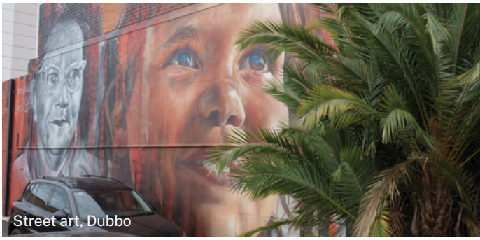
Street art, Dubbo