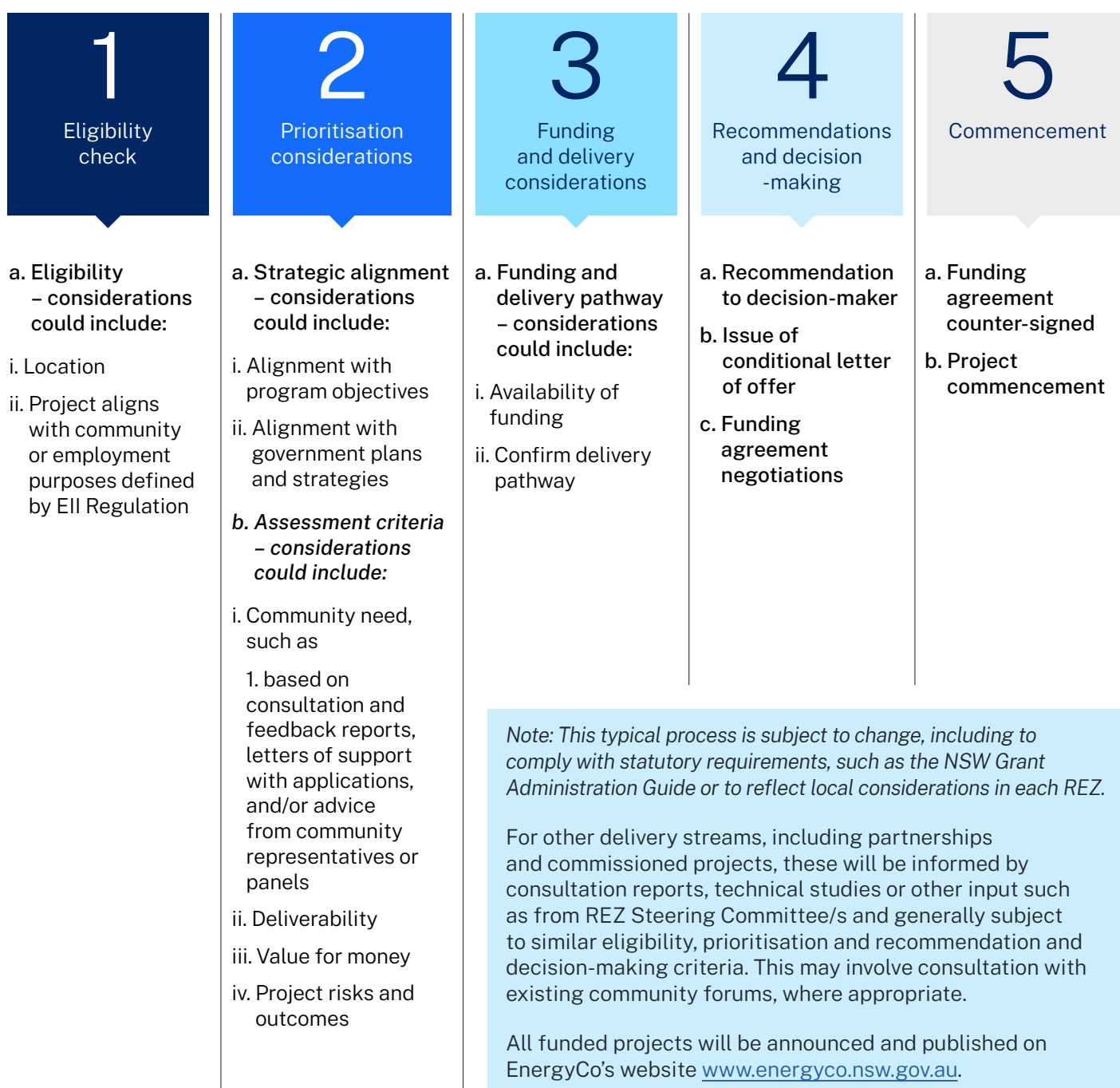
Figure 1: Typical process and considerations

An outline of a typical selection process is provided in Figure 1 below. For grant rounds, an assessment panel will make recommendations about project selection and/or prioritisation. More information on eligibility and assessment criteria for grant rounds will be outlined in specific grant guidelines that will be made publicly available in accordance with the NSW Grant Administration Guide.