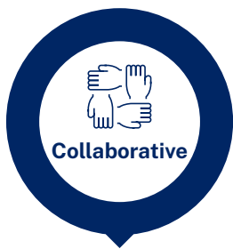
Table 1: Program principles

Local communities, councils, First Nations organisations and other stakeholders help to identify priorities and needs, consult on program guidelines and criteria and participate in evaluation and inform decision-making processes.