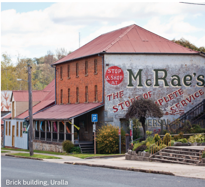
Brick building, Uralla

However, the Program does complement other work by EnergyCo to foster local community support for the infrastructure required to implement the Roadmap. Read more: www.energyco.nsw.gov.au/community/coordinating-delivery-renewable-energy-zones