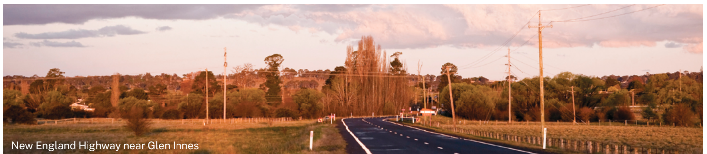
New England Highway near Glen Innes

EnergyCo will run a procurement process in accordance with the NSW Government Procurement Policy Framework. These types of projects will vary in nature and depend on the outputs from stakeholder consultation and applications received through grant rounds. They may involve initiatives like investing in telecommunications connectivity improvements or social housing projects.