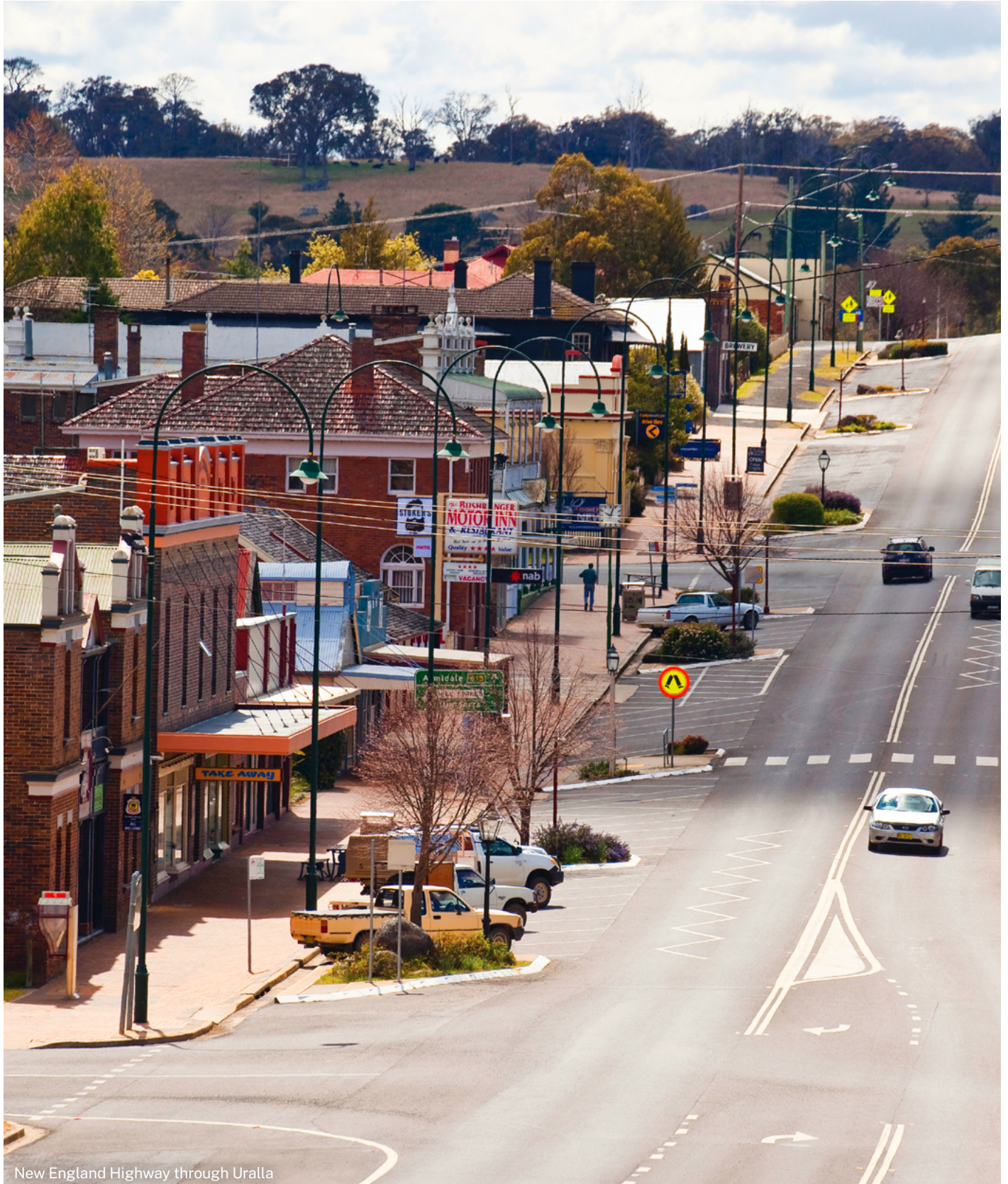
New England Highway through Uralla

Other scheduled reviews, such as annual reviews and program evaluations, may also report on outcomes from the Program. Feedback from local communities and delivery partners on the Program will form an important part of the monitoring and evaluation of the Program against the objectives.