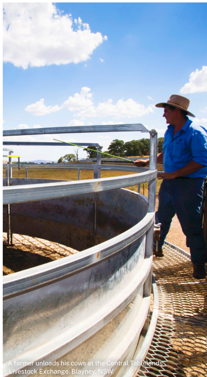
A farmer unloads his cows at the Central Tablelands Livestock Exchange, Blayney, NSW.

How communities may be supported to apply for funding and deliver benefits?