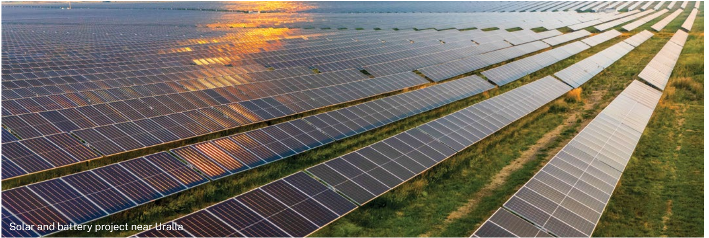
Solar and battery project near Uralla